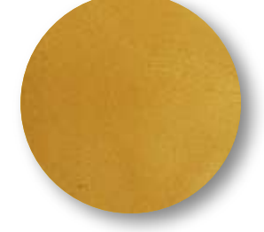
Zaree Gold Lustre KZ - 7221