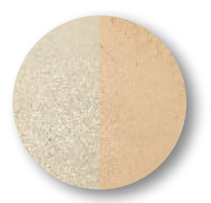
Zaree Orange Shimmer KZ - 7662