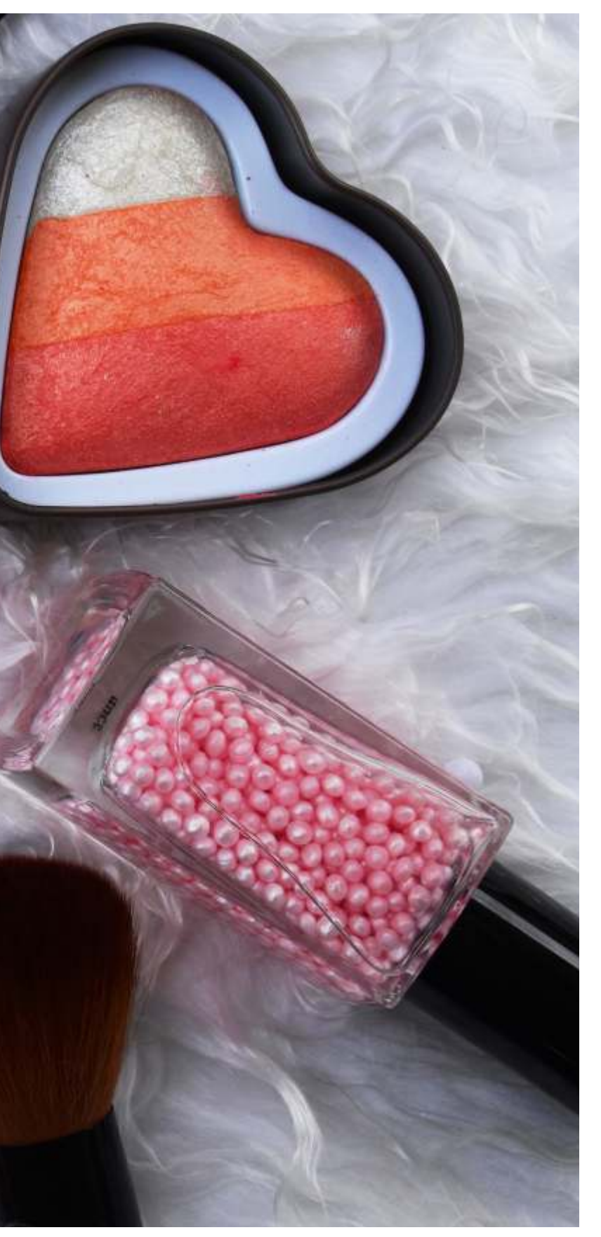
Note : Shades shown are for indicative purpose only.