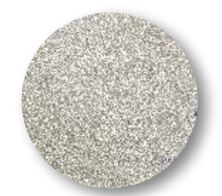
Zaree Silver Super Glitter KZ- 7115