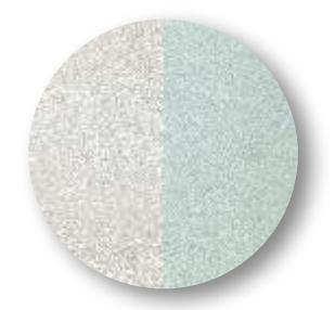
Zaree Blue Shimmer KZ - 7663