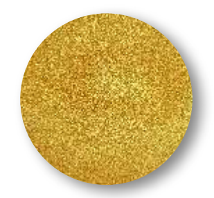
Zaree Synthetic Gold Sparkle KZ - 7773

Zaree Synthetic Silver Shimmer KZ - 7772