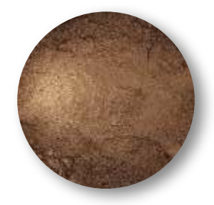
Zaree Nutmug Gold KZ - 7223