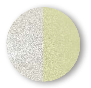
Zaree Green Shimmer KZ - 7661