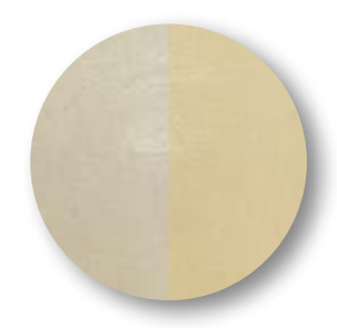
Zaree Gold Shimmer KZ - 7664